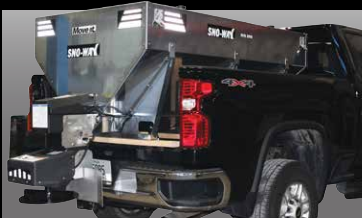
RVBS 2000 shown with optional short chute and no tie down straps.

The RVB stainless steel spreaders have been added to the Sno-Way RVB family. They are built for the professional snow and ice removal specialist. The Revolution Spreader line uses a heavy duty electric motor, direct drive gear box to run the auger and a 1/3 horsepower electric motor, direct drive gear box to run the spinner. The stainless steel hopper is mounted on a stainless steel custom frame and drive support, to give you a spreader that will provide you years of service. Sno-Way is known for having the best spread pattern in the industry.